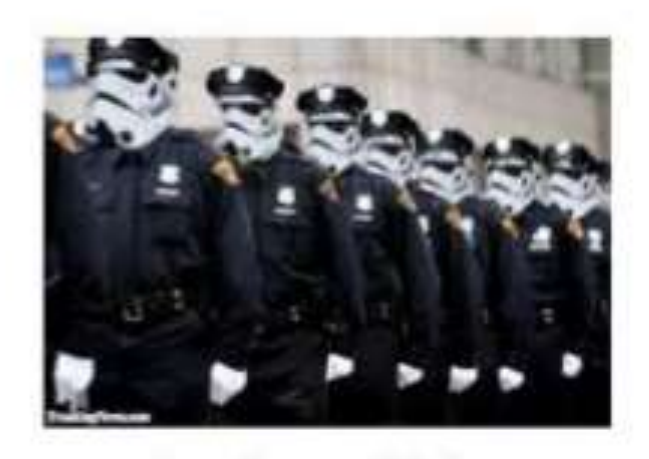
Storm Troopers (Police)