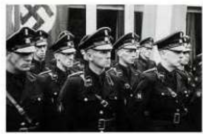
Gestapo (Secret Police)